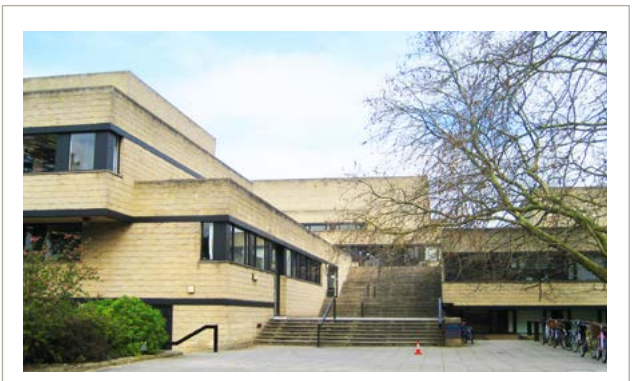
The Faculty of Law, Oxford