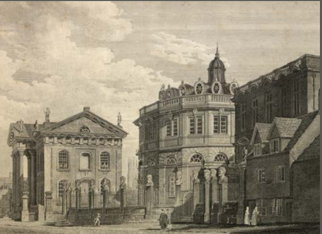
Engraving of University buildings on Broad Street, Oxford, by James Basire, from a drawing by Edward Dayes, c.1800

Oxford played a leading role in training British civil servants for service abroad from the middle of the nineteenth century. In the 1960s these courses opened up to aspiring diplomatic leaders from around the world, transforming into the Diplomatic Studies Programme, also known as the Foreign Service Programme, which still exists today. The Programme now has more than 1,200 alumni and has contributed staff to more than 140 countries' diplomatic services.