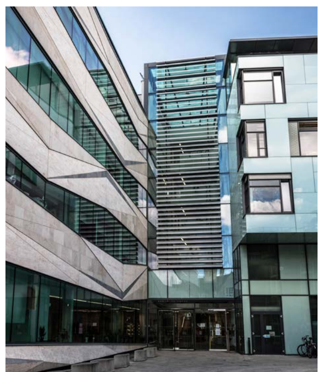
Department of Earth Sciences, Oxford

Dubai airline Emirates is a member of the Professionalising Data Science network, run by Oxford's Mathematical Institute. The airline joined the network, which provides data science expertise to a range of large businesses, after funding the Emirates Data Science Lab in the Institute for three years.